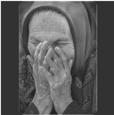
Class-S Proj-Mono Oh No Art Lee