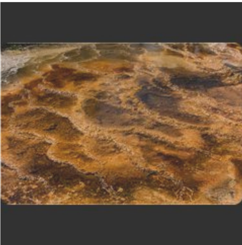
Class-A Proj Minerals in the Water Sheila Basem