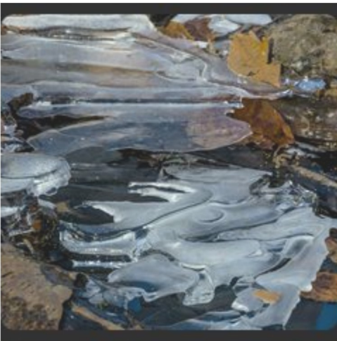
Class-S Proj-Color Ice At The Tourne Ira Nemeroff