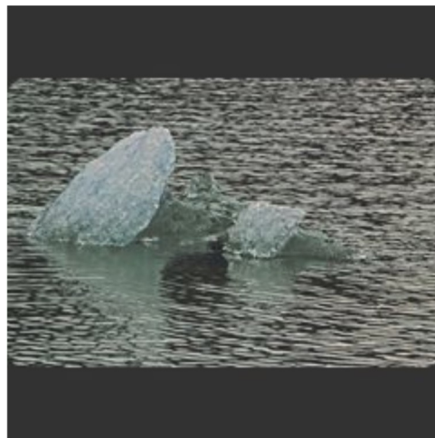
Class-B Proj Glacier Ice Bill Lerner