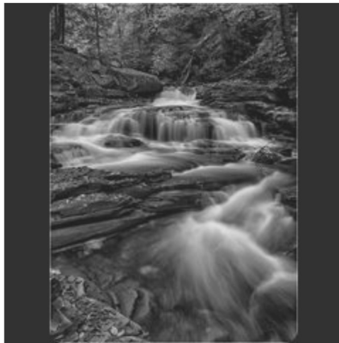
Class-S Proj-Mono Water braids Barry Wolfe