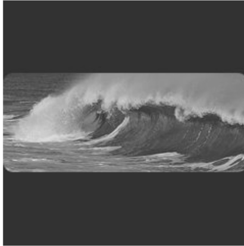
Class-S Print-Mono Wave Crashing on Sandy Hook Shore