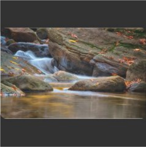
Class-S Print-Color Fall Colors Art Lee